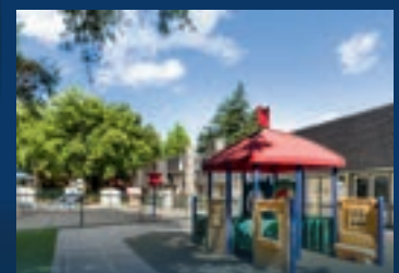
Outdoor Play Areas