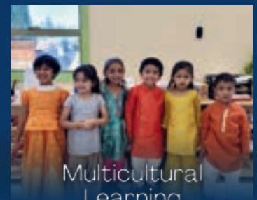
Multicultural Learning Environment