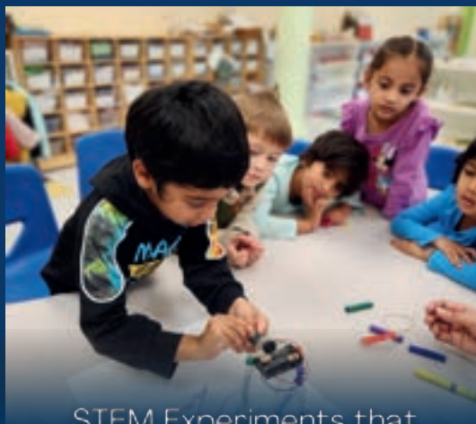
STEM Experiments that Enhance Problem Solving Skills

In our tech-driven world, a strong STEM foundation is crucial. LAPMS integrates STEM through engaging activities, fostering problem-solving skills and laying the groundwork for future academic success.