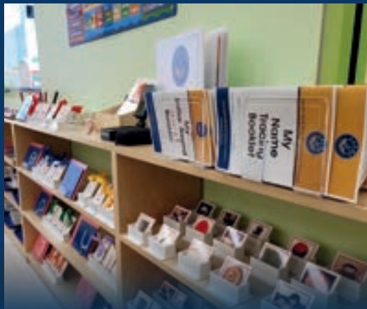
Personalized Montessori Booklets and Worksheets

LAPMS Montessori excels with an innovative, Montessori-rooted curriculum, surpassing traditional methods. Individualized plans ensure academic progress and instill a lifelong love for learning.